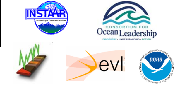
Image Strips from IODP Legacy Datasets for use in Visualization Software