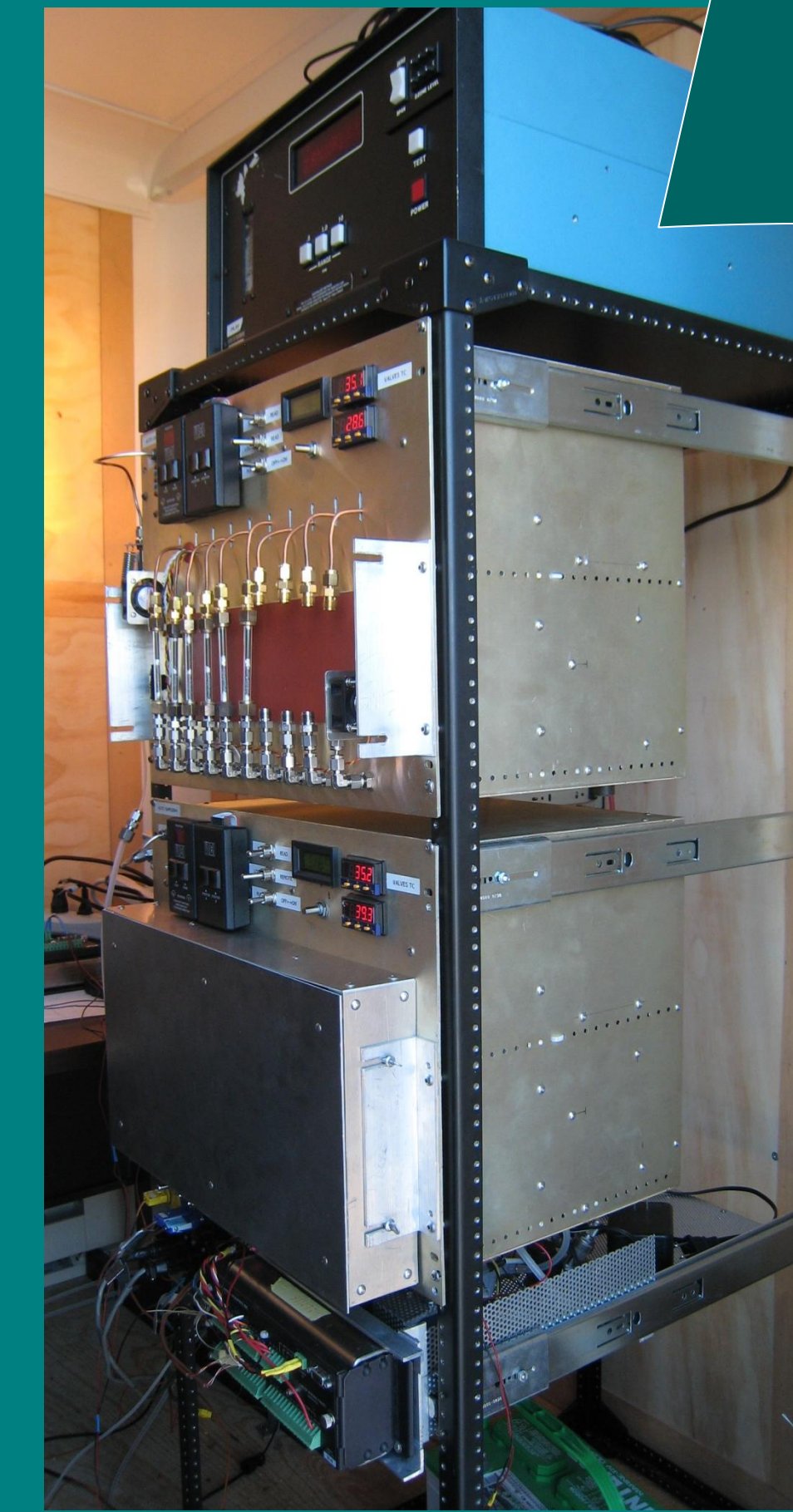
Inside the trailer that houses our instruments is this sampler, used to measure VOC emissions from tree leaves.

To measure VOC emissions, a researcher ties a Teflon bag around a tree branch. An instrument pumps clean air into the bag and routes outgoing air through another, highly sensitive analytical monitor that measures emissions from the leaves. Instruments also keep track of temperature and sunlight. Once