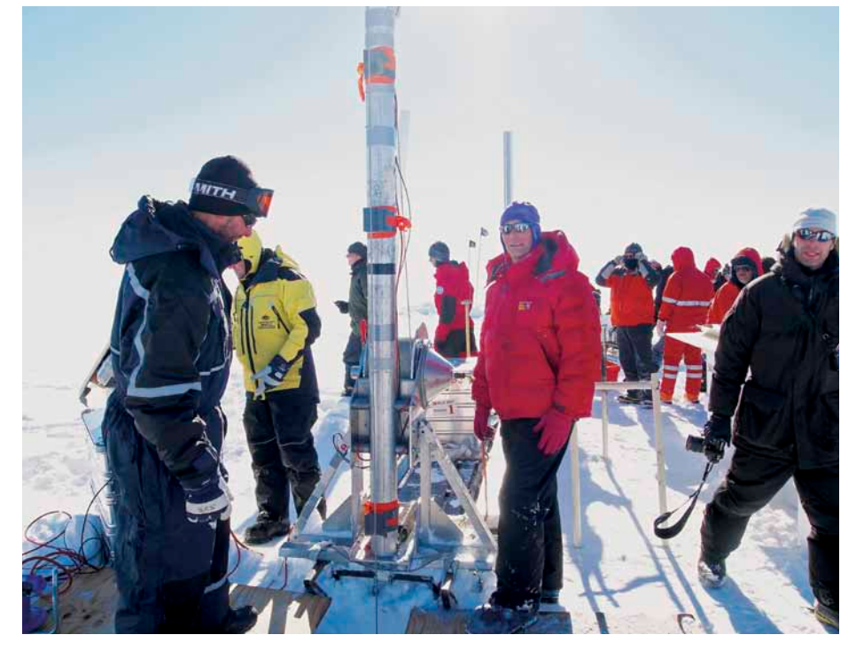
White drilling ice cores in Antarctica.

I also learned that the interdisciplinary approach I had taken was not the way the rest of the world worked, particularly in higher education. I've always found it ironic because all of us, regardless of the field we work in, challenge the reigning ideas and paradigms. But when it comes to education, the world is carved up into disciplines, and many people don't want to entertain the idea of rearranging.