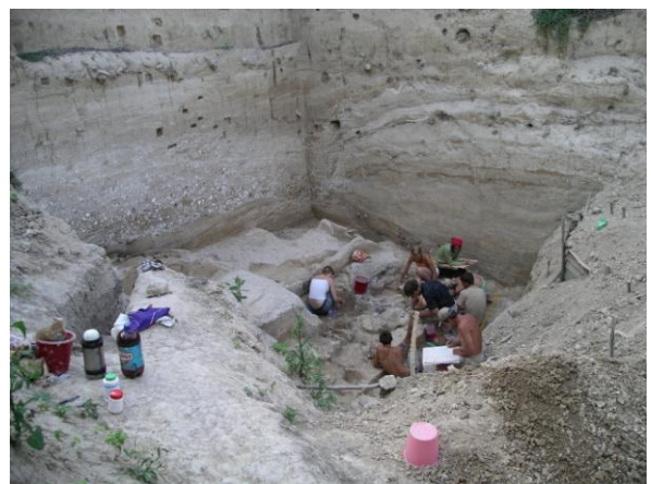
Figure 6. Kostenki 14, Layer IVa excavation in late August 2008.