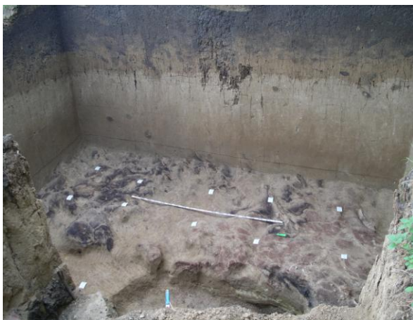
Figure 5. Kostenki 8: 5 x 3 meter excavation unit excavated in 2008 showing Layer II/III occupation floor (late EUP).

In 2008, a 15-m 2 excavation block (5 x 3 meters) was opened up in an area adjoining the eastern wall of the 2007 test trench under the direction of V. V. Popov. Several hundred artifacts and associated medium and large mammal remains were recovered from Layers II-III (which are difficult to differentiate and may represent one thick zone of occupation comparable to Layer III at Kostenki 1). The stone artifacts included microblades. The occupation floor is unique to the EUP at Kostenki and comprises a dense concentration of occupation debris in sediment saturated with red ochre and charcoal (see Figure 5). Both the artifact assemblage(s) and occupation floor are similar to those of the middle Upper Paleolithic (Eastern Gravettian) and may reflect changes in society and economy at the end of the EUP that anticipate the Gravettian.