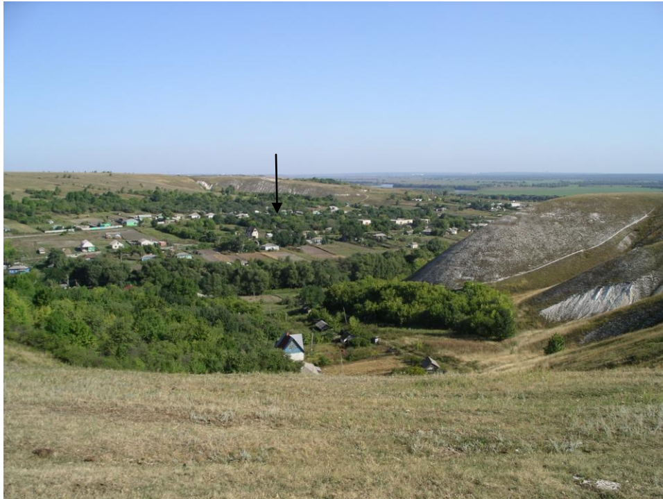
Figure 1. Topographic setting of Kostenki 1 (indicated by arrow) on the north side of Pokrovskii Ravine, which empties into the Don Valley.

Pleistocene large mammal remains have been turning up at Kostenki for more than two hundred years, but evidence of Paleolithic occupation was first recognized in 1879 (Klein 1969). During the late 19 th century and the first half of the 20 th century, investigation was primarily focused on the large Gravettian settlement at Kostenki 1 (Efimenko 1958). During the years following the Second World War, the late A. N. Rogachev uncovered many stratified occupation levels of EUP age (see Praslov and Rogachev 1982) and Kostenki became a major source of information on this critical period of prehistory.