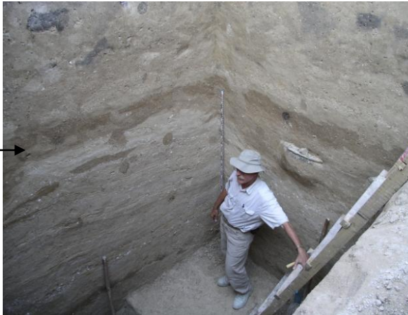
Figure 7. Kostenki 17: V.T. Holliday standing in stratigraphic profile pit (showing east and south walls). Buried soil indicated by arrow.

Access to the area excavated in 1953-1955, 1963, and 1980 was precluded by current land use, and field research was confined to an area north of the original excavations that did not yield any artifacts. However, the primary object of the 2008 investigations was new information on stratigraphy. A profile pit measuring 3.7 x 2.9 meters (to a depth of more than 6 meters) was excavated by members of the Kostenki 14 crew; the stratigraphy was recorded in detail, sediment samples collected (for soil micromorphology analysis), and extensive photographs were taken by Holliday and Hoffecker. The most significant finding was the identification of a previously unreported buried soil horizon in the upper part of the profile that appears similar to the b2 (or Bryansk Soil) at Kostenki 1.