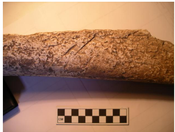
Figure 4. Kostenki 1, Layer V mammoth ulna with apparent cut marks excavated in 2006 and examined in 2008.