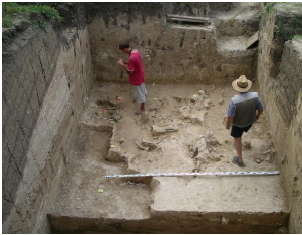
Figure 3. Kostenki 1, Layer III feature comprising large mammal bones exposed during 2008 excavations.

In earlier years, Layer III produced an assemblage containing diagnostic Aurignacian forms, and is widely recognized as the most typical such assemblage in Eastern Europe. More recently, however, this level has also yielded artifacts typical of the East European Streletskaya culture, characterized by a high percentage of Middle Paleolithic tool types (often manufactured on low quality local raw material). The feature uncovered in 2008 reinforced a pattern observed at other Kostenki EUP occupations—that these artifacts are consistently associated with probable traces of large-mammal butchery (Hoffecker 2009a).